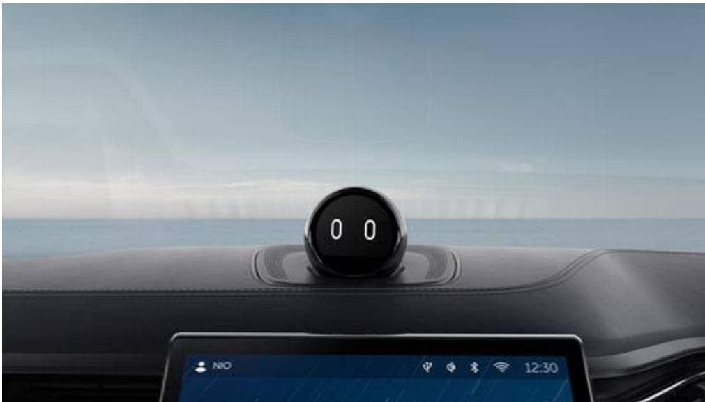
NOMI has been updated with more expressions and further enhanced speech capabilities

ES6 features pre-installed NIO Pilot hardware, including a Mobileye EyeQ4 chip and 23 sensors. NIO Pilot supports over 20 functions covering typical scenarios of car use in China. Functions can be upgraded over time via firmware-over-the-air (FOTA).