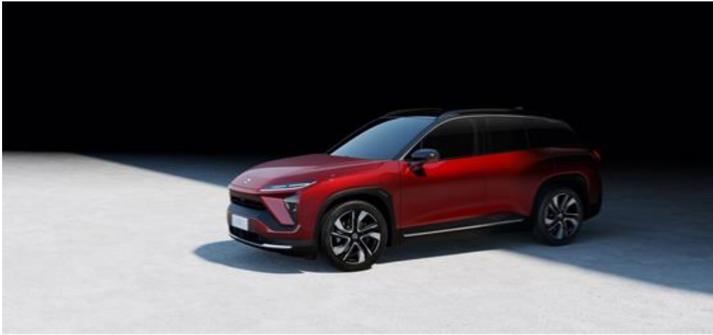
The NIO ES6 brings a comfortably large space

The ES6 has a length of 4,850 mm, a width of 1,965 mm, a height of 1,768 mm and a wheelbase of 2,900 mm, bringing a comfortably large space.