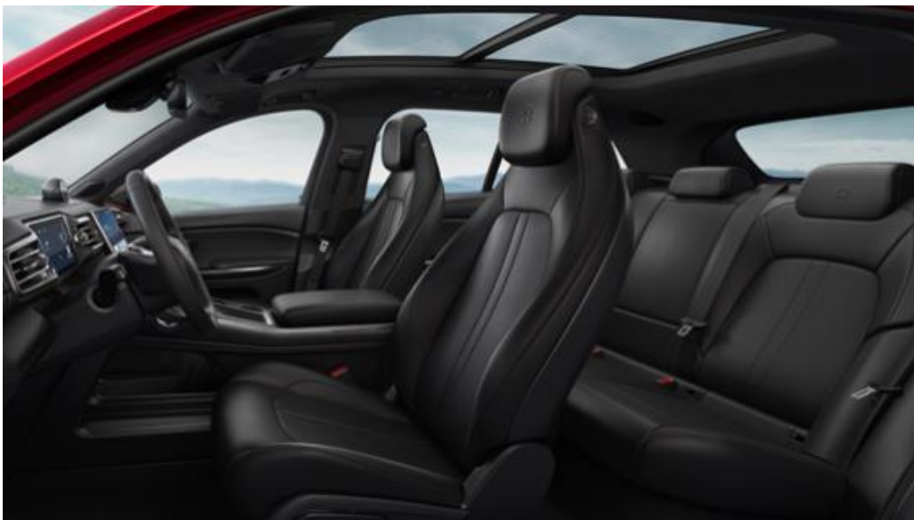
Nappa leather upholstery throughout the interior and individual bucket seats

The newly designed sport seats and multifunctional leather steering wheel add to the interior's sporty atmosphere. The microfiber headliner, Nappa leather upholstery and unique Eclipse Chrome trim throughout the interior underscore technology and refinement.