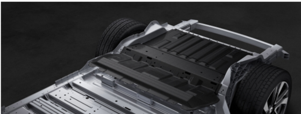
Aluminum alloy and carbon fiber compose the vehicle body