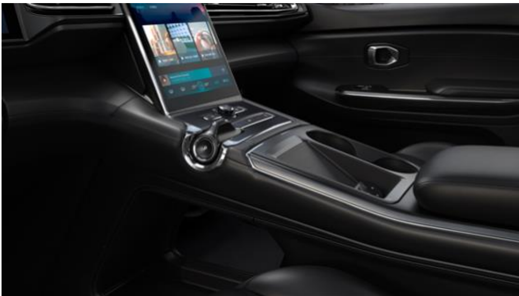
11.3 inch second-generation multitouch screen

An intelligent fragrancing system offers four different fragrances for a more pleasant occupant experience. This optional system interacts with the vehicle's other systems for automatic pairing with different user accounts and situations.