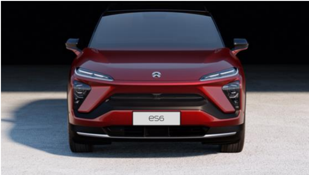
The X-bar across the front end is in the same color as that of the body

The newly designed sport seats and multifunctional leather steering wheel add to the interior's sporty atmosphere. The microfiber headliner, Nappa leather upholstery and unique Eclipse Chrome trim throughout the interior underscore technology and refinement.